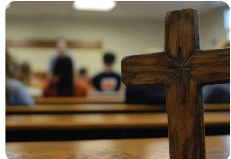
The plaintiffs included three Orthodox Jewish families in the Los Angeles area, each with children diagnosed with autism.

Since 1993, California law has permitted the use of public funds to cover the cost of private school education for students with disabilities, but only at nonsectarian institutions. That requirement was declared unconstitutional by a federal judge after the U.S. 9th Circuit Court of Appeals ruled in October that the law appeared to violate the First Amendment's guarantee