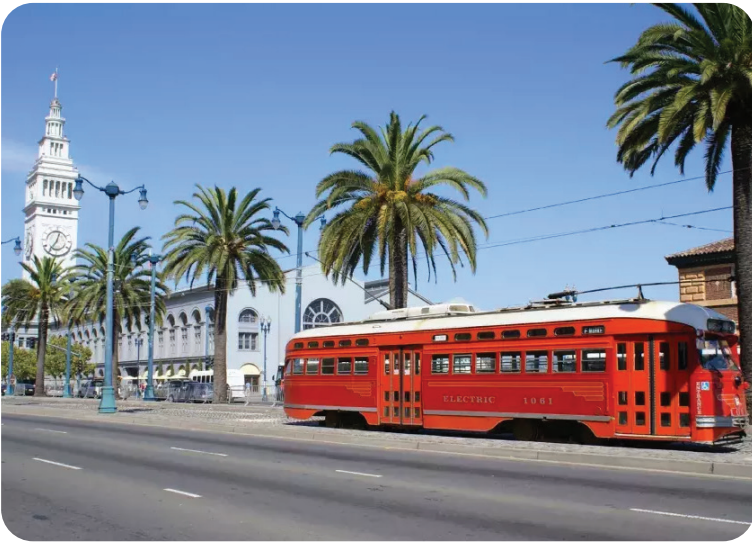
The state also boasts the fifth busiest port complex in the world—the ports of Los Angeles and Long Beach—connecting U.S. goods to global markets.

Cultural exports remain an underrated economic force. Events like Coachella and Stagecoach alone generate nearly $700 million annually for local communities, while California's film and television industry