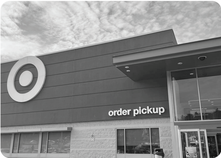
The retailer is grappling with falling foot traffic, public boycotts, and criticism over its retreat from diversity goals.