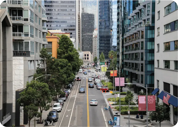
Project Will Create 300 Homes for Low-Income Seniors and Formerly Homeless Families