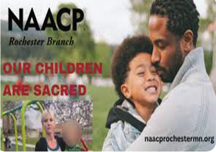
The Rochester Branch of the NAACP said the incident, which occurred on April 30, was a deliberate and threatening act of racial hate—not a misunderstanding or isolated outburst

The Rochester Branch of the NAACP said the incident, which occurred on April 30, was a deliberate and threatening act of racial hate—not a misunderstanding or isolated outburst. According to the organization, the child, who is also reportedly on the autism spectrum, was targeted with repeated