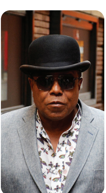
Tito Jackson but had made a name for

Though never officially disbanding, the Jacksons saw their members explore solo endeavors. Tito ventured into a solo career later in life, releasing his debut album "Tito Time" in 2016, followed by "Under Your Spell" in 2021. His work as a solo artist showcased his versatility and deep-rooted love for music, allowing him to step out of the shadow of his famous family name. Tito also fronted a blues band that performed mainly in Southern California itself nationally.