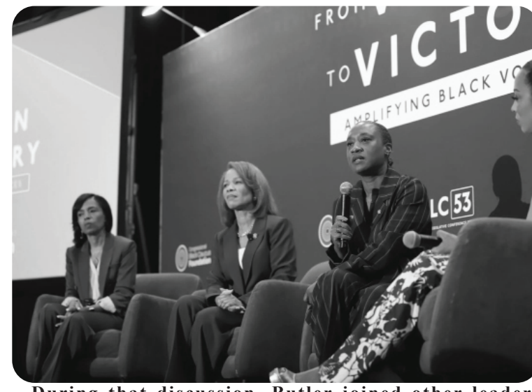
During that discussion, Butler joined other leaders in AI to emphasize the importance of embracing AI in Black communities and using the technology to create economic opportunities

Black women's maternal health crisis and delivered remarks on about Black