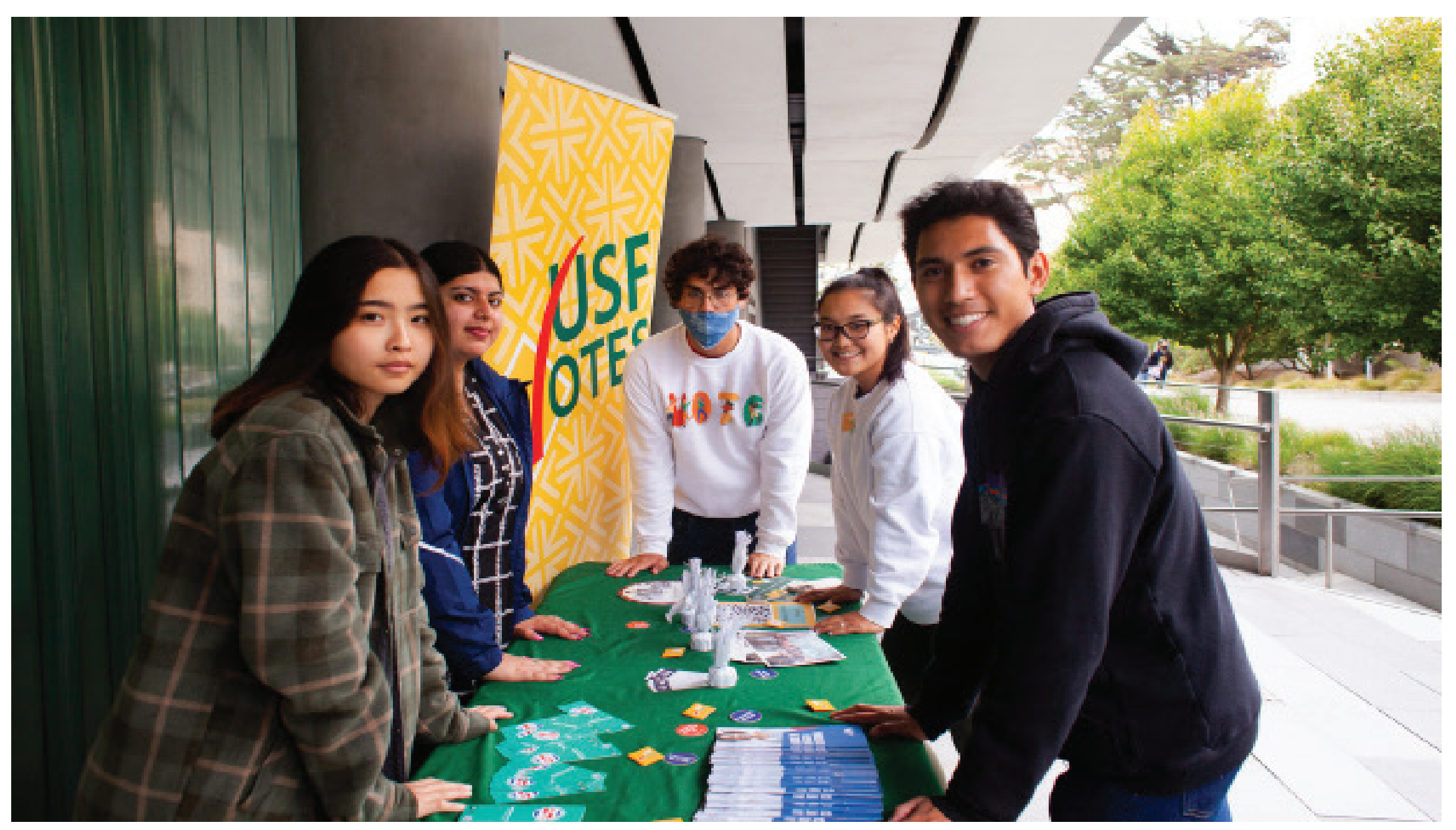
Our USFVotes team is elevating voter education, engagement, and registration tactics in anticipation of the upcoming November election. Using the framework from our All-In Award for Highly Established Democratic Civic Action Plan, we will have consistent weekly outreach opportunities to engage with various internal and external collaborations and partnerships to reduce the barriers to voting for young people throughout this election cycle.