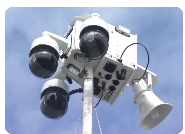
The camera trailers will expand on Proposition E technology, like security cameras and drones, to assist officers in making arrests and preventing crime

While crime has been dropping significantly (32%) in 2024 in San Francisco, the SFPD is actively continuing We must fight to to address ongoing challenges like drug dealing, burglaries,