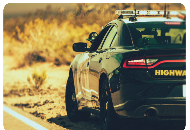
About 120 California Highway Patrol officers are being deployed in the operation – about a 900% increase, according to the Governor's office

"I'm sending the California Highway Patrol to assist local efforts to restore a sense of safety that the hardworking