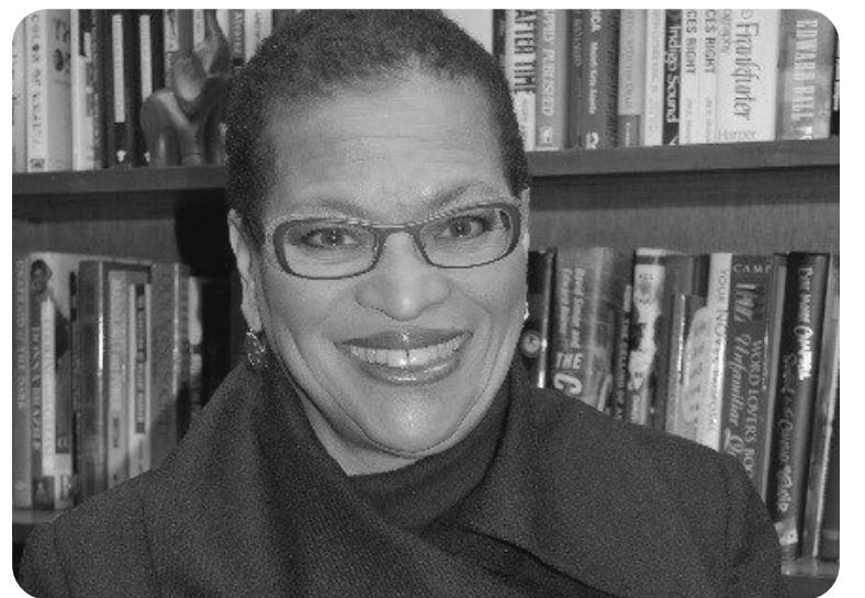
Dr. Julianne Malveaux