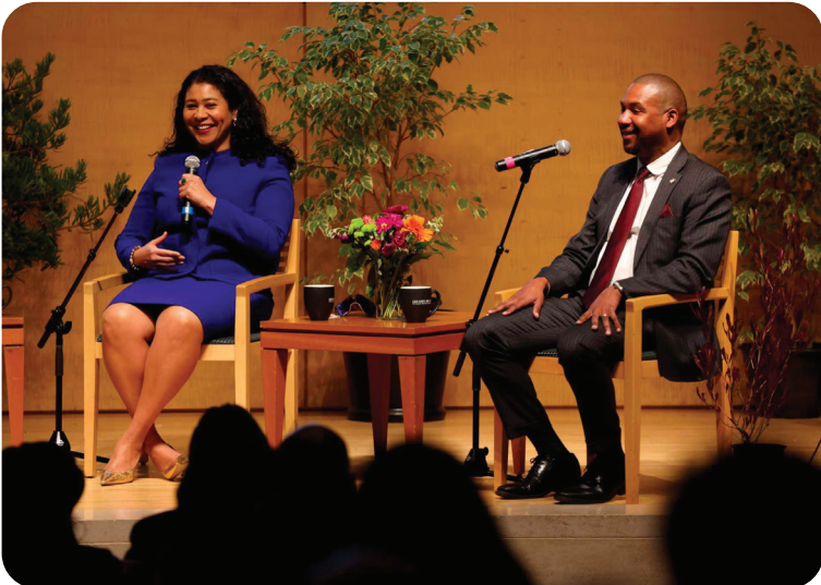
San Francisco Mayor London Breed with Distrit 10 Supervisor Shamann Walton