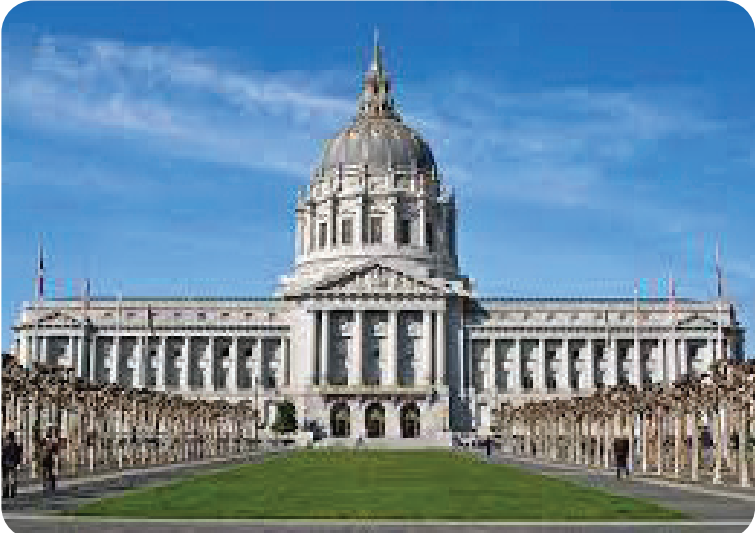
Since the free program began in 2017 under an ordinance sponsored by Mayor Breed when she was Supervisor, the City has kept unsafe medications out of communities, outdoor spaces and water sources

health and environmental sustainability." The safe collection and disposal of unused pharmaceuticals is an essential public safety imperative. Unused medicines can all too easily be diverted for illegal use and resale. As cities across the country grapple with the sale of illegal narcotics, this program has kept more than 140,000 pounds of medicine off the street—and out of trash bins, protecting children, pets, and wildlife who come into contact with medicines from accidental poisoning. Additional risks for children include consumption of medicines mistaken for candy, and sanitation workers that can be harmed by discarded injectors such as Epi-Pens, if thrown in the garbage. Due to federal DEA requirements, only pharmacies, hospitals or clinics with a pharmacy, law enforcement agencies, and narcotics treatment programs can lawfully host medicine collection kiosks. Residents in all 11 of San Francisco's Districts can drop their expired and unwanted medicines in the collection kiosks at all San Francisco Police Stations, Zuckerberg San Francisco General Hospital's outpatient pharmacy, Kaiser Permanente, and many retail pharmacies throughout the city including many CVS and Walgreens locations.