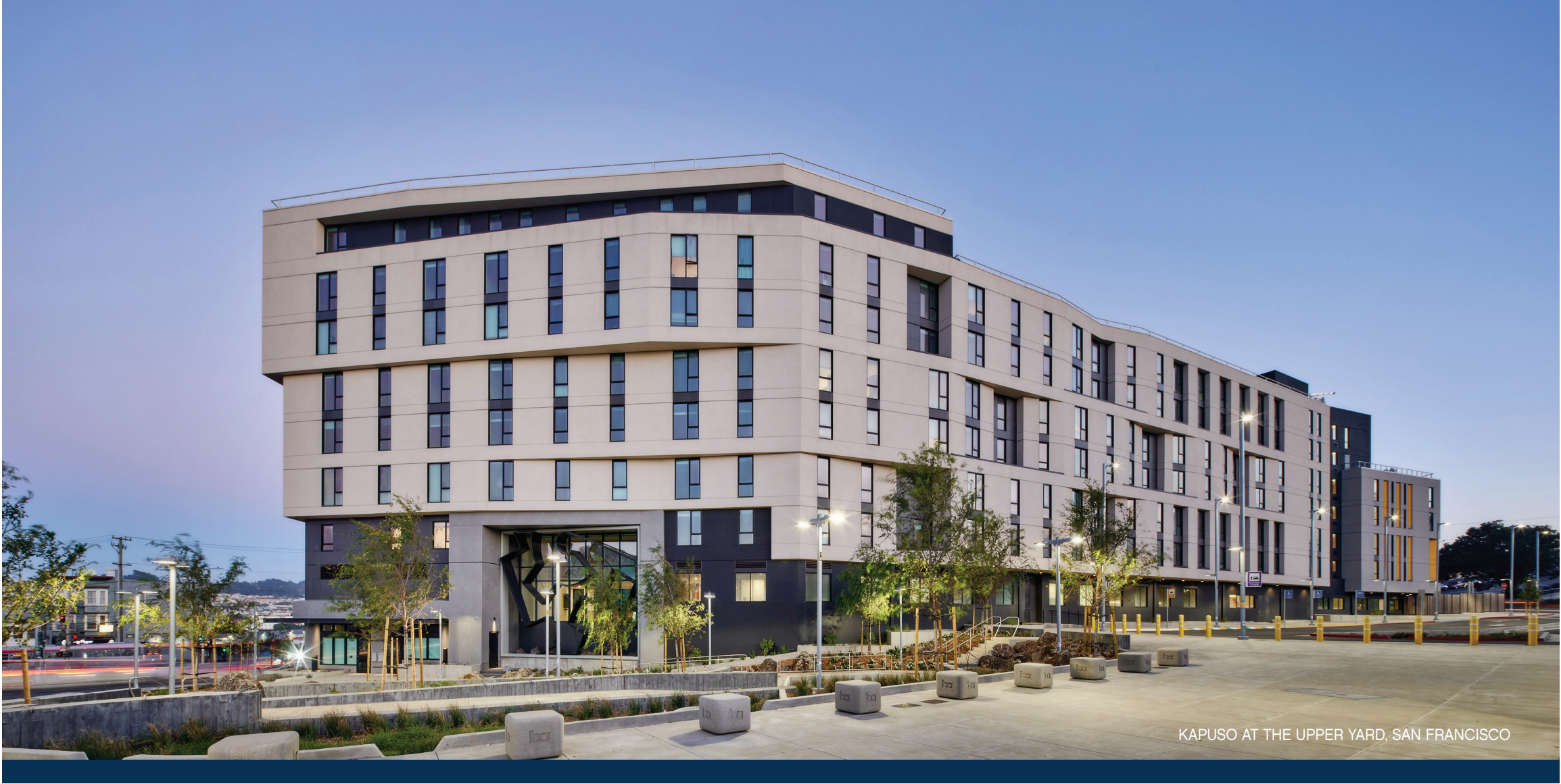
KAPUSO AT THE UPPER YARD, SAN FRANCISCO

or poisoning. Medication collection sites like those we have in San Francisco are a valuable and necessary service that helps people to prevent medications in their name from hurting someone." The safe collection and disposal of unused pharmaceuticals is also an environmental imperative. Wastewater treatment plants are not designed to remove pharmaceutical chemicals, and when medicines are flushed down the toilet or poured down the drain, they can pass untreated into surrounding waterbodies and contaminate drinking water sources. When old medicines are thrown into garbage destined for landfill, they can also leach into waterbodies.