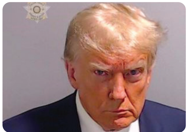
A federal jury in New York has slammed the twice-impeached and four-times criminally indicted former President Donald Trump with a massive sexual assault and defamation judgment.

Trump, visibly displeased, left the courtroom but later