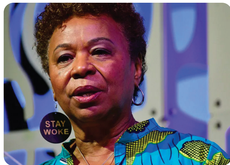
U.S. Senate Barbara Lee

Congresswoman Barbara Lee is the highest-ranking Black woman appointed to House