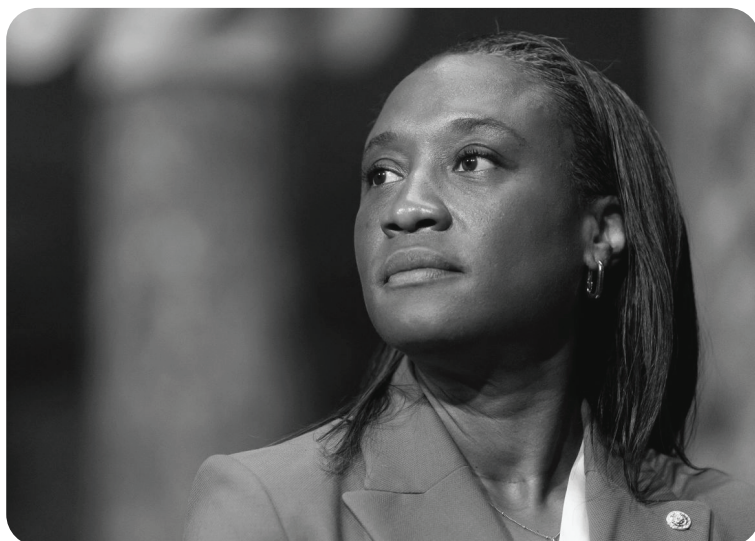
U.S. Sen. Laphonza Butler

Since her appointment, Butler has also supported the Youth Voting Rights Act, which would allow eligible 16-year-olds to pre-register to vote; and other legislation that would improve the lives of women and children, including the Women's Health Protection Act of 2023, which would protect access