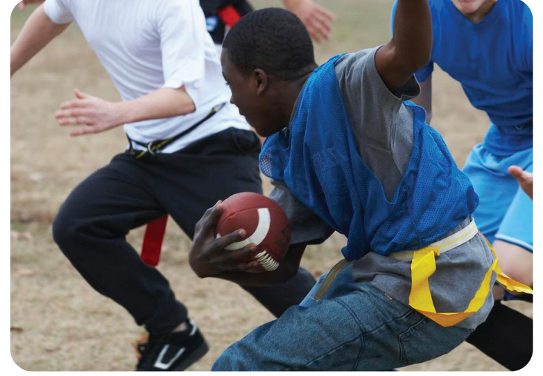
McCarthy’s says there is credible research indicating that tackle football can affect the brains of young children.

“It is simply saying that we’re going to move from