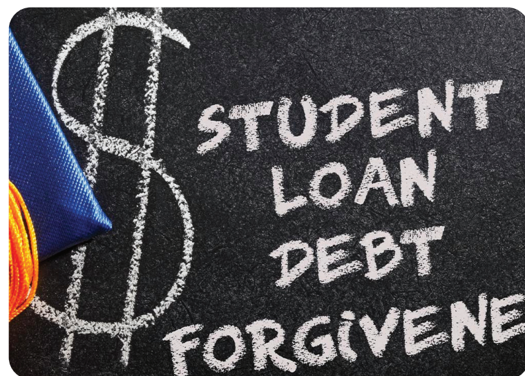
The president asserted that his administration’s SAVE plan has helped 3.6 million Americans by canceling their student debt.

A gain, attempting to fulfill a key promise made during his 2020 campaign, President Joe Biden announced the accelerated implementation of a crucial provision under the Student Aid for Voluntary Education (SAVE) plan. The president reaffirmed his commitment to reforming the student loan system and ensuring that higher education remains a pathway to the middle class, “not a barrier to opportunity.”