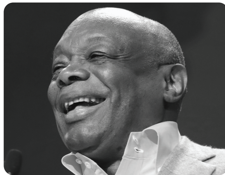
Former San Francisco Mayor and California Assembly Speaker Willie Brown

Inductees are selected annually by the Governor and First Partner.