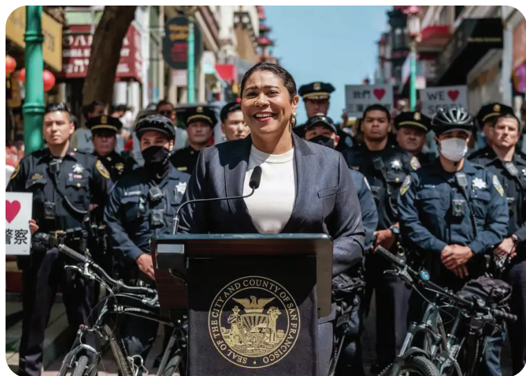
New Police Academy class starting today joins two other classes currently training at SFPD Academy – higher cadet levels reflective of efforts to strengthen recruitment through increased pay, expanded outreach, and streamlined hiring

S an Francisco, CA – Today Mayor London N. Breed and Police Chief William Scott announced that the San Francisco Police Department (SFPD) has welcomed its latest Academy Class, bringing the total of three Police Academy classes currently training. The presence of these three SFPD Police Academy classes is the highest number of cadets training at any one time since before the pandemic.