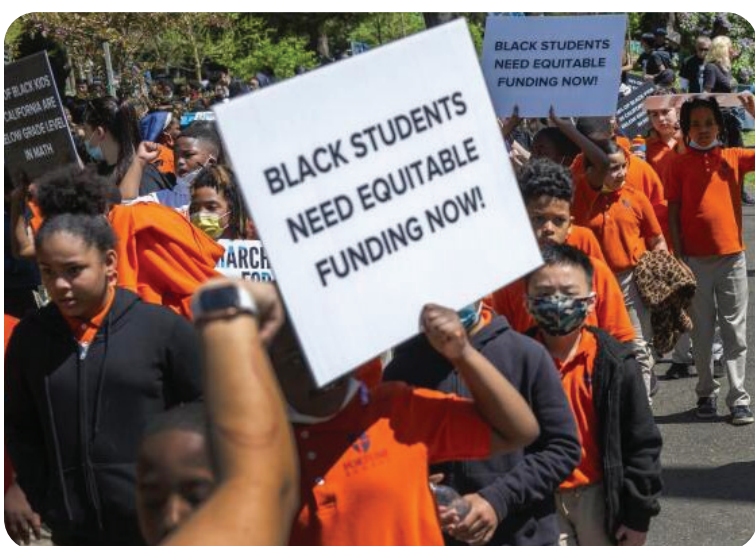
In California, the total number of children within the study’s age range is 13.7 million. Of that number, 5 % (roughly 685,000 children) is Black or African American (roughly 685,000 children) is Black or African American.

In California, the total number of children within the study’s age range is 13.7 million. Of that number, 5 %