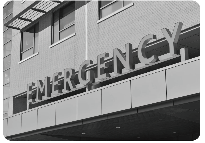
The most segregated hospital markets were determined by examining the proportion of hospitals within a metropolitan statistical area receiving either 1 star (lowest score) or 5 stars (highest score) on Lown's racial inclusivity ranking. All cities included on the list had more than 20% of hospitals at those extremes.

markets were determined by examining the proportion of hospitals within a metropolitan statistical area receiving either 1 star (lowest score) or 5 stars (highest score) on Lown's racial inclusivity ranking. All cities included on the list had more than 20% of hospitals at those extremes.