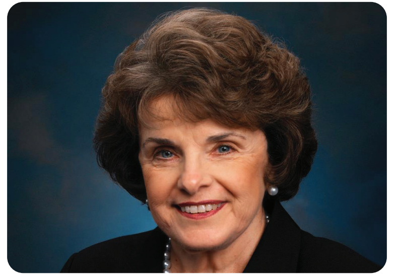
Feinstein made history as the first woman elected to the U.S. Senate from California. She served over three decades in the upper chamber of the U.S. Congress and was the oldest lawmaker on Capitol Hill.

"I am saddened by the passing of Senator Dianne Feinstein, one of our nation's great leaders and someone I was blessed to call a colleague and friend," added Bass. "Senator Feinstein was a trailblazer on whose shoulders I, and