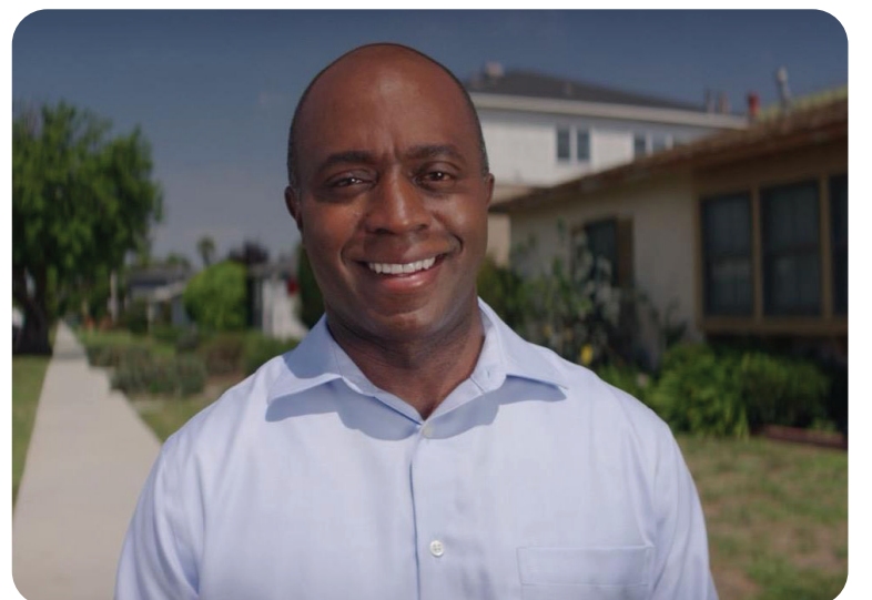
In a social media post, the Democrat wrote: "I didn't come from money, power, or influence. I'm running for Governor to be a voice for those who need one — because California may be working for millionaires and billionaires but for the rest of California — we need real change."

"I didn't come from money, power or influence," he continued. "Mom emigrated from Panama and became a classroom teacher, but died when I was six years old. My dad served the nation but left us after the Vietnam war."