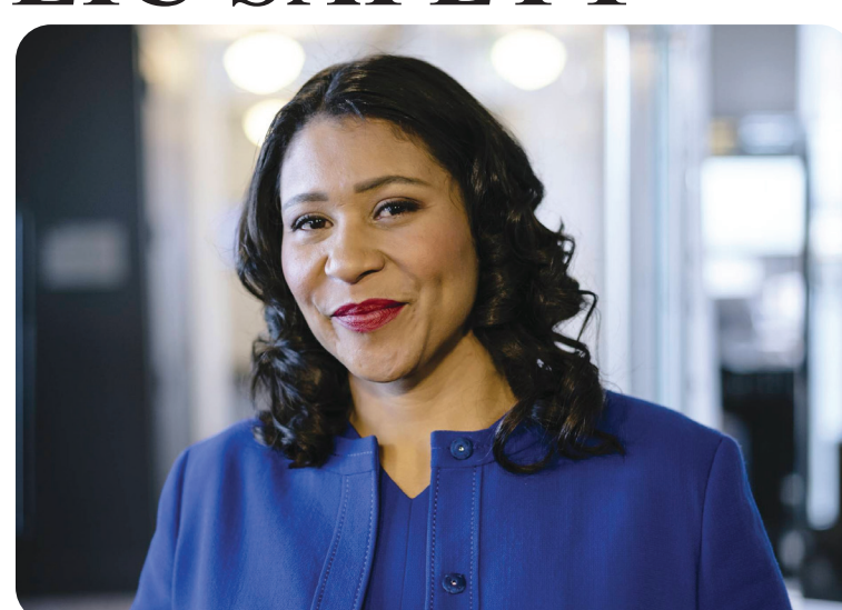
Mayor Breed will sign this measure onto the March 2024 ballot, where it would need a simple majority to pass into law

Changes rules to get more officers out on the street and pursue criminals.