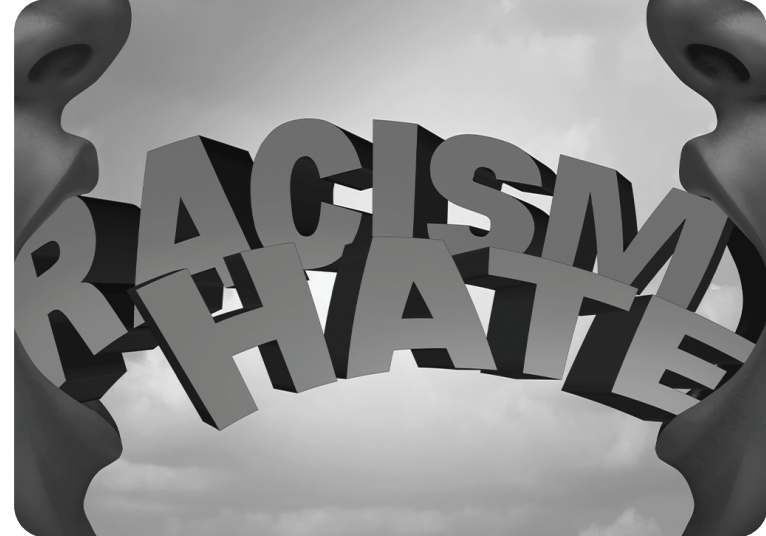
Recent attacks in New York and Chicago are stark reminders of the urgent need for increased awareness and action.

While there was a positive 38 percent decrease in hate crimes targeting Asian Americans, the overall levels remained stable, underscoring the need for sustained efforts to eradicate hate-fueled violence. Anti-LGBTQI+ hate crimes rose 16 percent, and Muslim and African Americans continue to be overrepresented among victims, Biden said