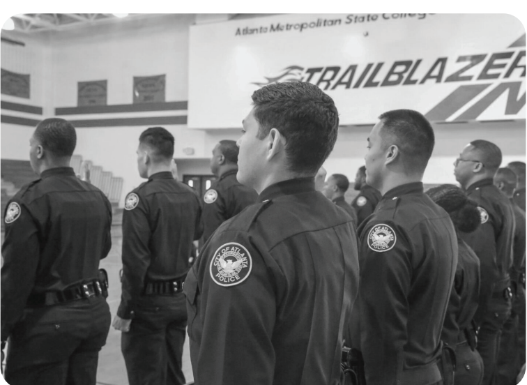
In the report titled "Recruitment and Retention for Modern Law Enforcement Agency," DOJ officials concluded that the law enforcement profession needs to update its hiring and retention practices.

Further, agencies have been advised to implement diversity initiatives and remove barriers hindering inclusivity to build a more inclusive workforce. The DOJ recommended working with community leaders to encourage diverse