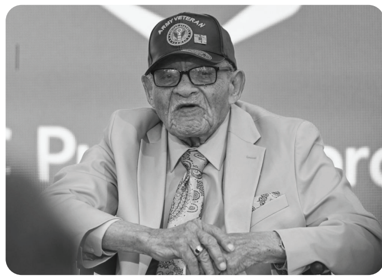
Hughes Van Ellis

A statement released by the family stated, "Mr. Hughes Van Ellis, 102, passed Mon. Oct. 9th at 11:30 am in Denver, Colorado. A loving family man, he was known as "Uncle Redd." He was among the three last known survivors of the 1921 Tulsa Race Massacre, one of the most horrific acts of racist terrorism on American soil. A WWII war veteran, Mr. Ellis, bravely served America, even as he spent a lifetime awaiting atonement related to the Tulsa Race Massacre. Mr. Ellis was aware, that survivors, his sister Mrs. Viola Ford Fletcher, 109, Mrs. Lessie Benningfield