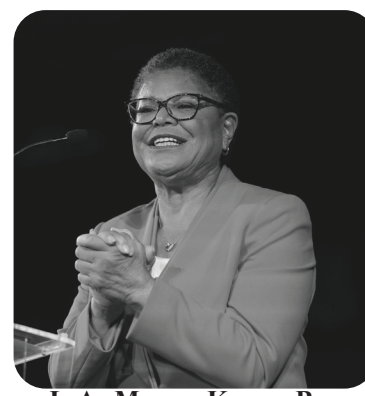
L.A. Mayor Karen Bass

the disregard for national and international impact for the whole world to see never happened under the leadership of Madam Speaker," said Bass referencing the United States House of Representatives vote to remove McCarthy on Oct. 3, through a motion to vacate filed by Rep. Matt Gaetz (R-Fla-1).