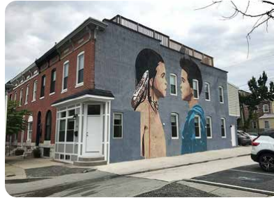
An undervaluation of a home is rarely corrected. Discriminatory treatment is harmful (and should be prevented) in any setting; in the context of home appraisals, it often comes with severe economic consequences.

"Our cultural conception of property values obscures the fact that human beings often determine those values," the investigators determined.