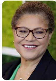
Rep. Karen Bass

elections held to fill state and federal offices, as with every statewide election, no final ballot counts are available on election night. Election results are updated at 5 p.m. each day throughout the canvass as counties count the remaining ballots.