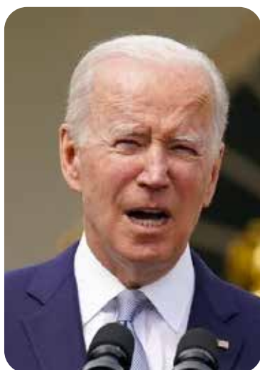
President Joe Biden

In January 2021, on my first day in office, I directed the Department of Education to pause federal student loan repayments through September of that year. At the time, our economy was barely growing. Fewer than 1 percent of Americans were fully vaccinated. Millions of Americans were struggling to stay afloat. Because of that pause in repayments, 41 million Americans