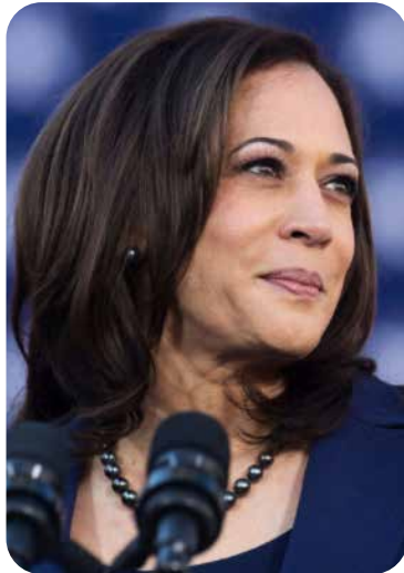
Vice President Kamala Harris

“Together, these actions will help hold medical providers and debt collectors accountable for harmful practices, reduce the role that medical debt plays in determining whether