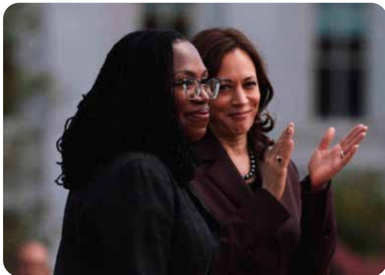
Judge Ketanji Brown Jackson and Vice President Kamala Harris

"It has taken 232 years and 115 prior appointments for a Black woman to be selected to serve on the Supreme Court of the United States," Jackson proclaimed a day after her confirmation during